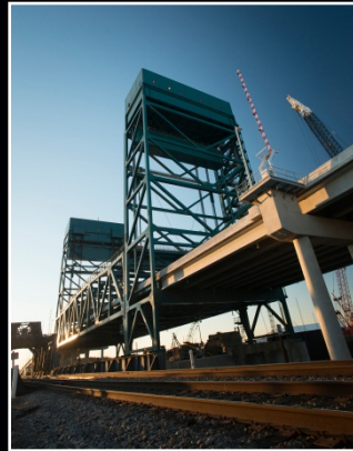
Henry G. Gilmerton Bridge over the Elizabeth River Modjeski and Masters, Inc.