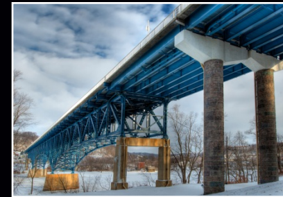
Freeport Bridge Rehabilitation over the Allegheny River Modjeski and Masters, Inc.