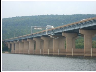
George N. Wade Bridge (SR 0081, Section 042) over Susquehanna River & Norfolk Southern RR tracks Gannett Fleming, Inc.