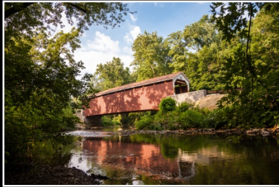
Siegrist Mill Covered Bridge Restoration RETTEW Associates, Inc.