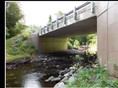
US 209, Raymondskill Creek Bridge, Delaware Water Gap National Recreation Area