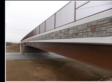
SR 2023 (Galloway Road) over PA Turnpike (I-276) Johnson, Mirmiran & Thompson, Inc.