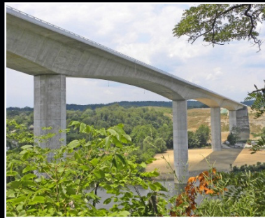
Monongahela River Bridge FIGG