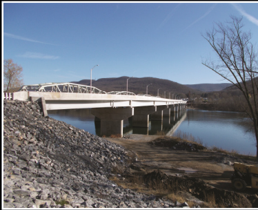
Duboistown Bridge Gannett Fleming, Inc.