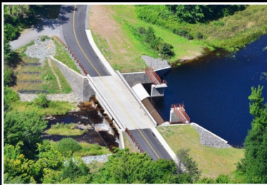
Lower Lake Bridge & Dam Larson Design Group