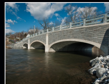
Burnt House Road Bridge Modjeski and Masters, Inc.