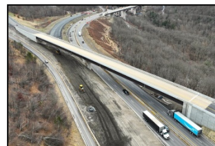
Long Span Category SR0435 SB over SR 0084, AECOM Technical Services, Inc.