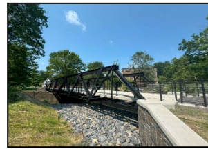
Short Span Category Charleston Street Connector, Wilson Consulting Group