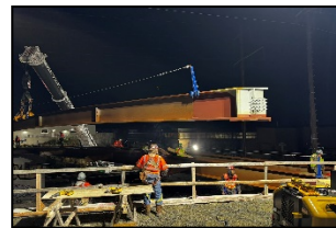
Medium Span Category Montgomery Avenue Bridge, Modjeski and Masters, Inc.